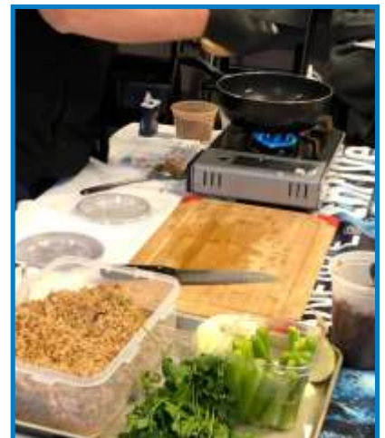
Chef photo: KP Chef Jochen Lawson

Heat oil in a Dutch oven over medium heat. Add onions and celery; cook, stirring often, until softened, 5 to 8 minutes. Add garlic, cinnamon and allspice; cook, stirring, for 1 minute. Add bulgur and stir for a few seconds. Add broth, bay leaf and salt; bring to a simmer. Reduce heat to low, cover and simmer until the bulgur is tender and liquid has been absorbed, 15 to 20 minutes. Meanwhile, combine dried cranberries and orange juice in a small microwave-safe bowl. Cover with vented plastic wrap and microwave on high for 2 minutes. (Alternatively, bring dried cranberries and orange juice to a simmer in a small saucepan on the stove top and remove from heat.) Set aside to plump. When the bulgur is ready, discard the bay leaf. Add the cranberries, parsley and pepper; fluff with a fork.